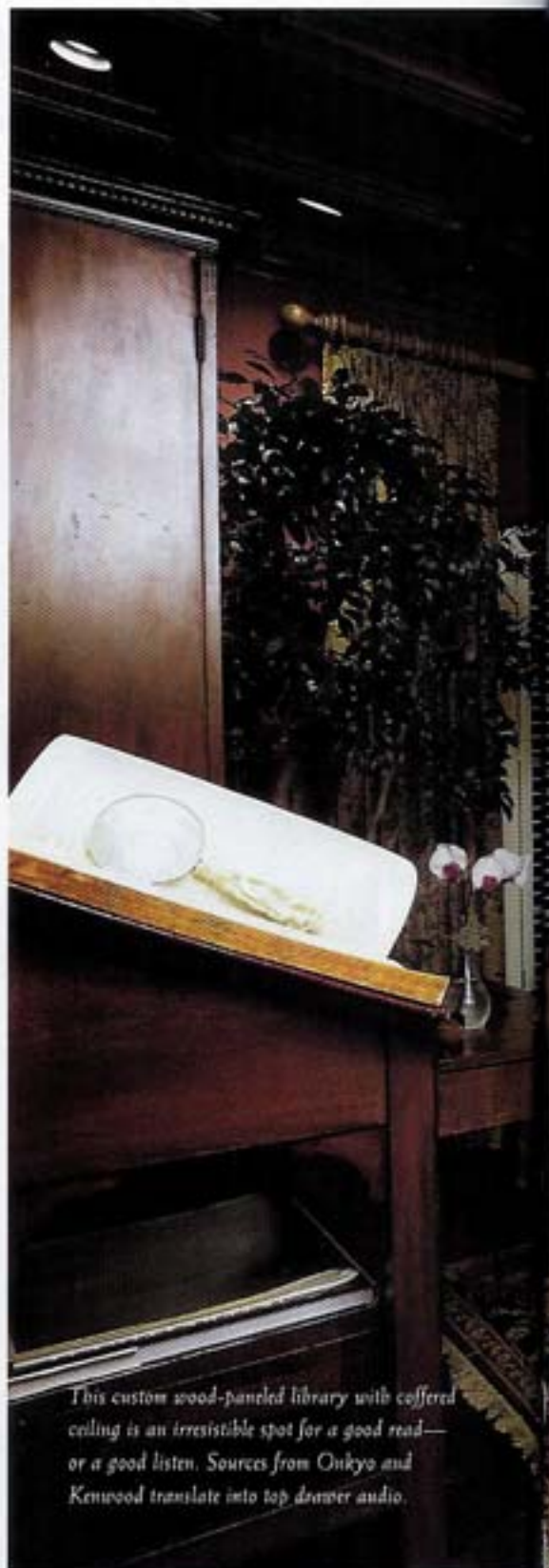
This custom wood-paneled library with coffered ceiling is an irresistible spot for a good read—or a good listen. Sources from Onkyo and Kenwood translate into top drawer audio.